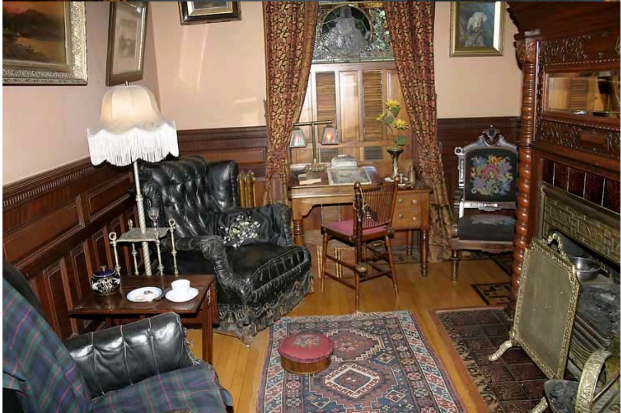
A visit at the sumptuous Craigdarroch Castle.